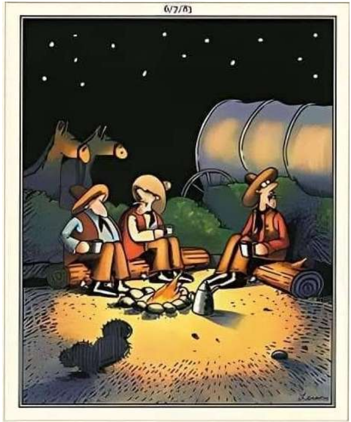
"Well, there it goes again. ... Every night when we bed down, that confounded harmonica starts in."

I'm sure that more info will follow --- but right now I'm busy reading! --- Al Price, N6ALP