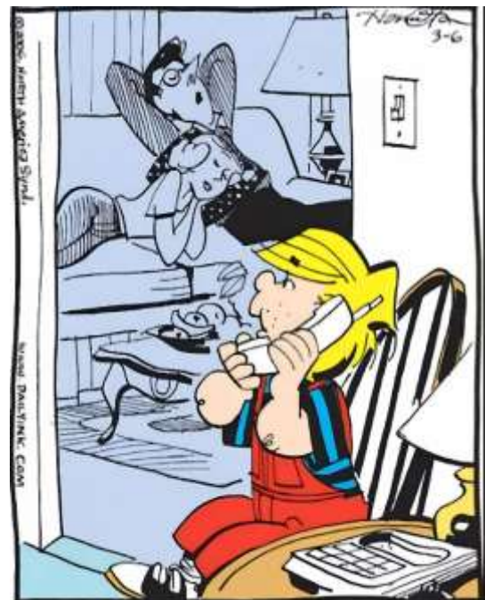
"MY MOM AND DAD NEEDED A TIME-OUT."